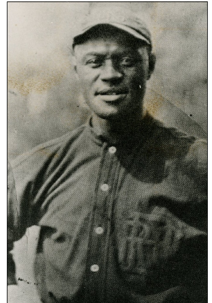
Negro League baseball great Pop Lloyd