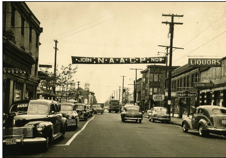
The Atlantic City Branch of the NAACP was established in the early 1960s.

Wright, Giles. A Civil Rights Turning Point: Fannie Lou Hamer in Atlantic City, 1964 . New Jersey Historical Commission, 2005. VHS tape documents the life and achievements of Civil Right's activist, Fannie Lou Hamer. A teacher's guide accompanies the video tape.