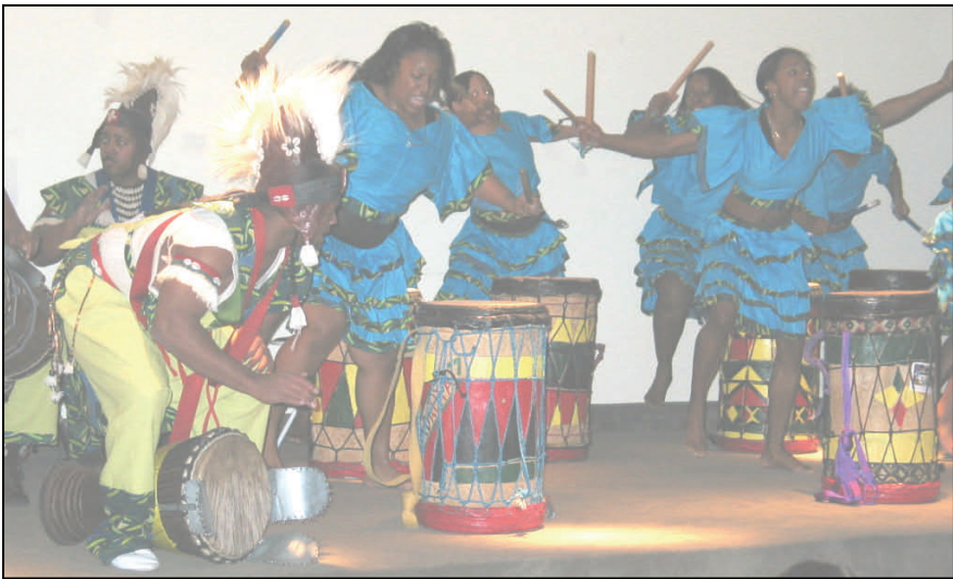
Sensational! The Universal African Dance & Drum Ensemble gave a scintillating performance at the Atlantic City Free Public Library's 20th annual Kwanzaa Celebration on Saturday, Dec. 15, dazzling spectators with its spirit and energy.