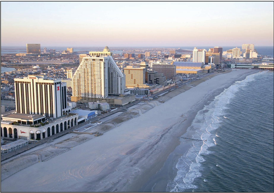
The opening of Resorts International in May 1978 forever changed Atlantic City — and its skyline.