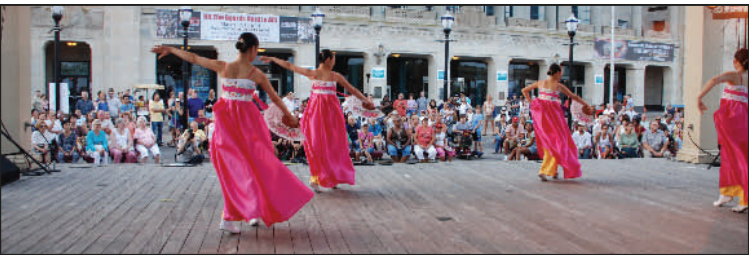
NARU Korean Contemporary Performing Arts opens the 2010 International Night Series on July 7.