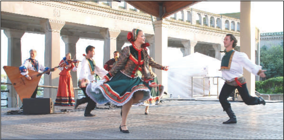
After putting on a terrific show at last year's series, Russian song and dance ensemble Barynya will again perform as part of the International Night Series. The New York City group's performance will be Aug. 11.