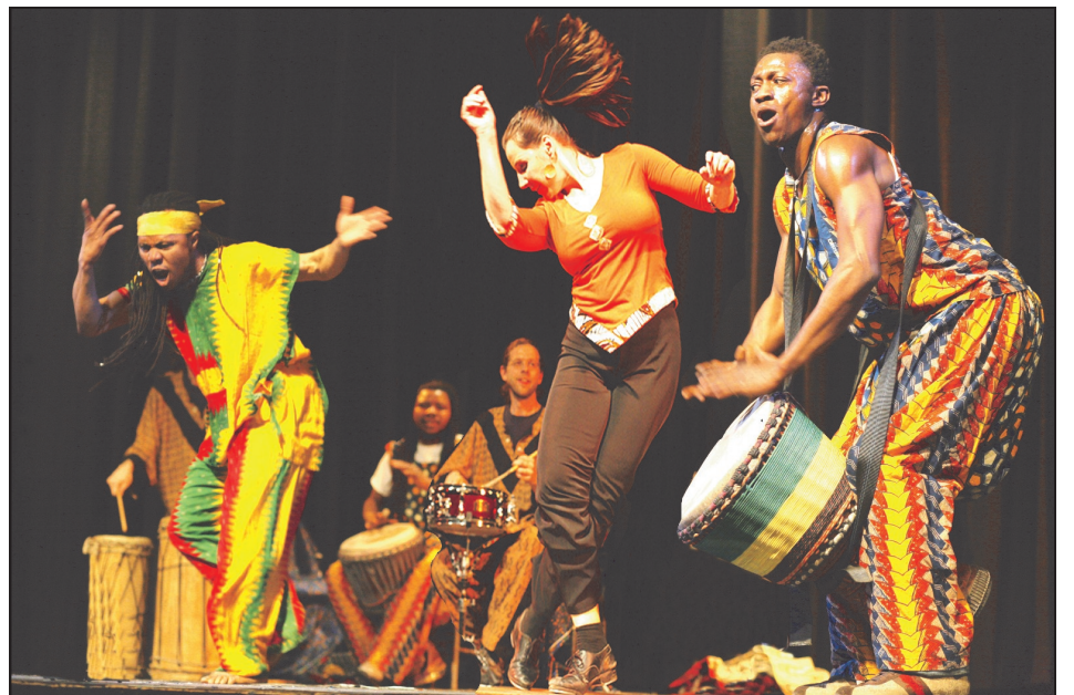
Feraba will perform West African music, vocals and dance on Aug. 3 as part of the International Night Series.

Call (609) 345-2269, ext. 3115, or (609) 377-7177 for more information.