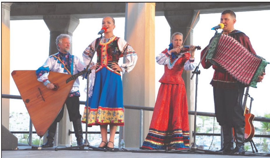
Russian ensemble Barynya, which has been an International Night favorite, returns for the fourth annual series Wednesday, July 27.