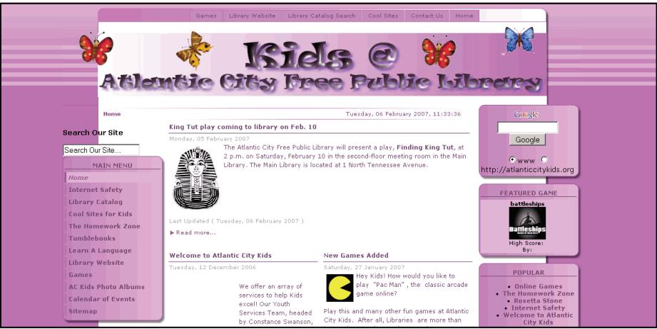
The Atlantic City Free Public Library's kids Web page consists of many great features, including information about upcoming Youth Services programs, a library catalog, Tumblebooks e-books and arcade games.

Visitors to the kids site will find a wide range of choices. Stories about upcoming kids programs and events will be a prominent part of