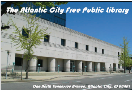
The Atlantic City Free Public Library will introduce its new membership card, above, during National Library Week.