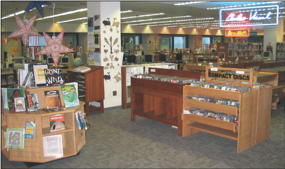
The Atlantic City Free Public Library redesigned the look of its Youth Services Department and audio visual area on the second floor of the Main Library, installing a new carpet and arranging a new layout for its resources. (Top) When you reach the top of the stairs, the compact discs, books on CD, computer center for kids and young adult area are to the right. (Bottom) To the left, there is a special area for young children.