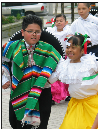
Local students will once again perform a folkloric dance at the city and library's Cinco de Mayo event.

part in the celebration after school by making arts and crafts with a library staff member from 3:30-4:30 p.m.