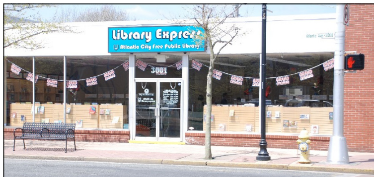
The Atlantic City Free Public Library opened its second location — the Atlantic City Library Express, located at 3001 Atlantic Avenue — on Thursday, April 22.