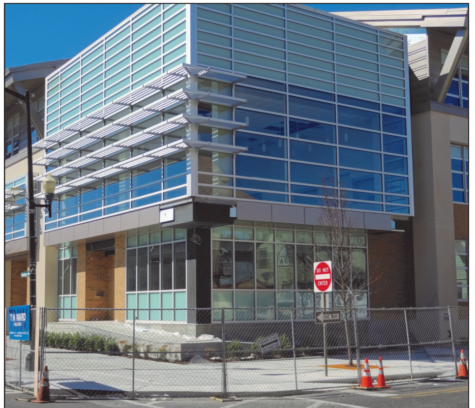
The new Richmond Branch Library, shown here in an Oct. 13 photo, will be five times larger than the previous Richmond Branch.