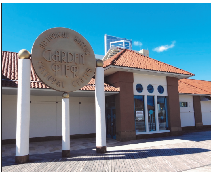
The Atlantic City Historical Museum — presented by the Atlantic City Free Public Library — averaged about 1,000 visitors per week after reopening in August.

EDITOR'S NOTE: THE MUSEUM CLOSED TEMPORARILY DUE TO HURRICANE SANDY, JUST BEFORE DISCOVERY WENT TO PRESS