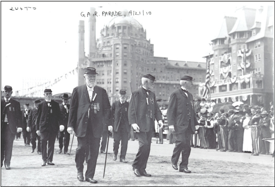
The Atlantic City Free Public Library and other local organizations will celebrate the 100th anniversary of the only Grand Army of the Republic Encampment held in Atlantic City. A re-enactment will be held at 1 p.m. Saturday, Sept. 25, at the Absecon Lighthouse in Atlantic City.