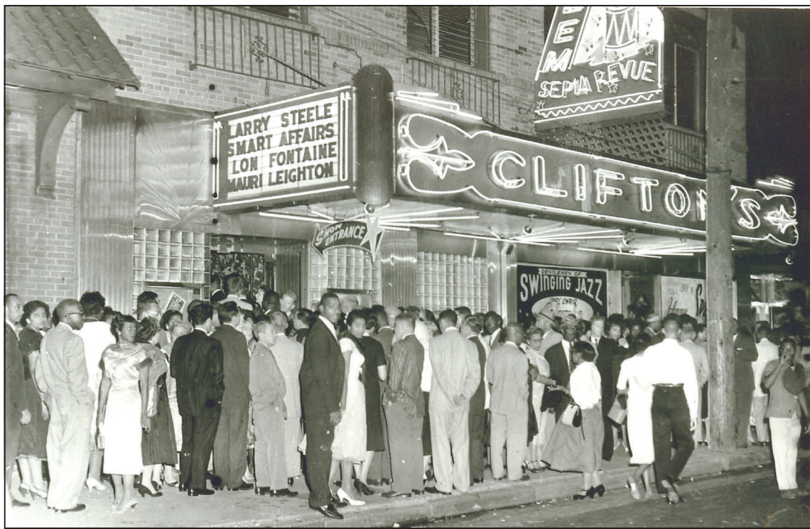
Club Harlem (pictured above) was at the center of the incredible nightlife and entertainment scene on Atlantic City's famed Kentucky Avenue.

And, he can picture people dressed in their finest clothes standing at one end of the club waiting to enter,