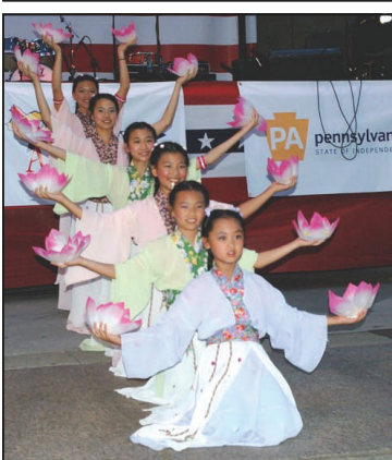
The Greater Philadelphia Minghui School Dance Team will perform traditional Chinese dances.

Please call (609) 345-2269, ext. 3050, for more information about these programs.