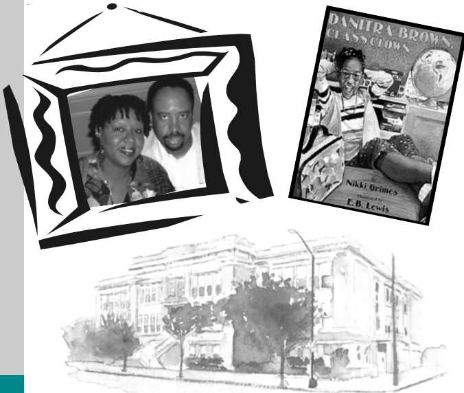
Richmond Avenue School and home of AC Public Library Branch