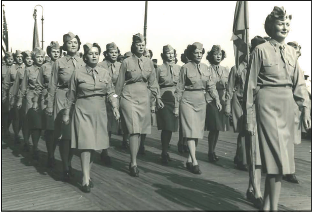
Female members of the military parade on the Atlantic City Boardwalk in 1945.

The Atlantic City Free Public Library, in conjunction with American Legion Post 61 and the African American Heritage Museum of Southern New Jersey, is looking for photos and other materials featuring military veterans who live or have lived in Atlantic City.