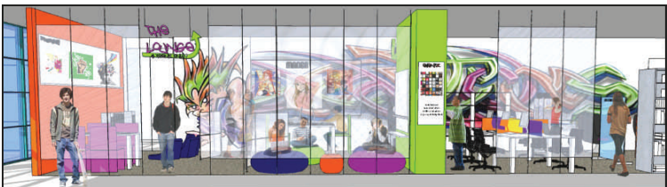
The Atlantic City Free Public Library incorporated input from local teens in creating plans for a new Teen Space.

The Atlantic City Free Public Library was selected to receive $40,000 in funding to create a special Teen