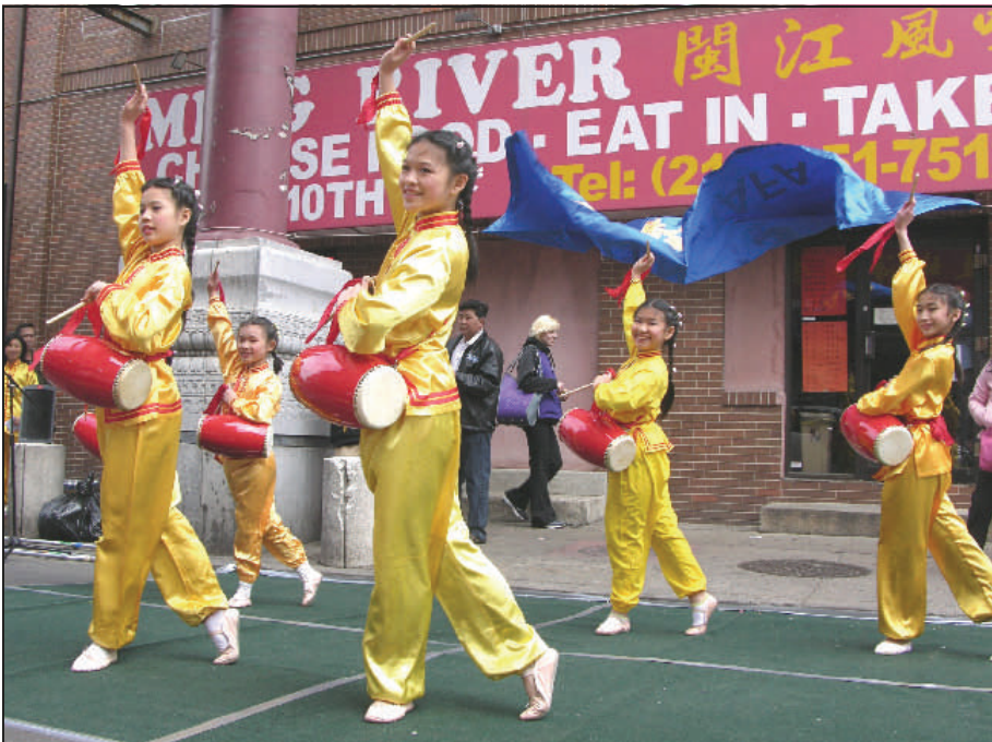
The Greater Philadelphia Minghui School Dance Team will perform at 12 p.m. Saturday, Jan. 17, for the library's Chinese New Year festivities.