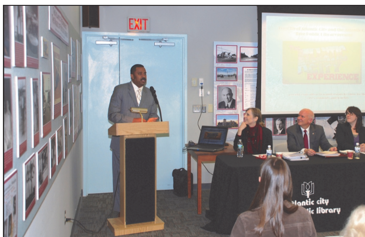
The Honorable Lorenzo T. Langford, Mayor of the City of Atlantic City, was one of the speakers at the public forum to announce the library’s proposed Atlantic City Experience museum and research center.

The feasibility study will provide essential information needed to move forward with this project, including: defining the market area and community needs; analyzing current and projected trends,