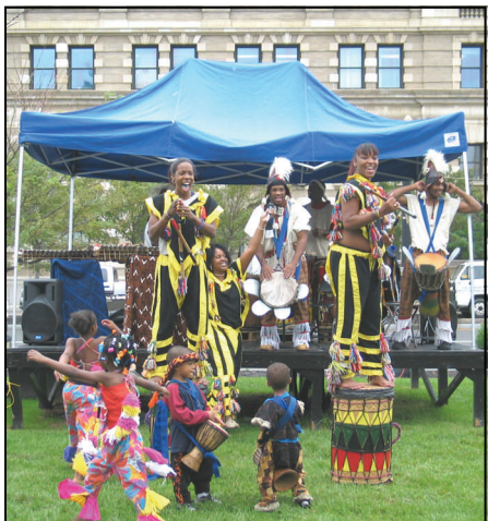
Universal African Dance and Drum Ensemble, pictured during last year's Atlantic City Arts, Books & Culture Festival, is scheduled to perform at the festival again.

Please visit www.atlanticcityfestival.org or www.acfpl.org for more details about this festival.