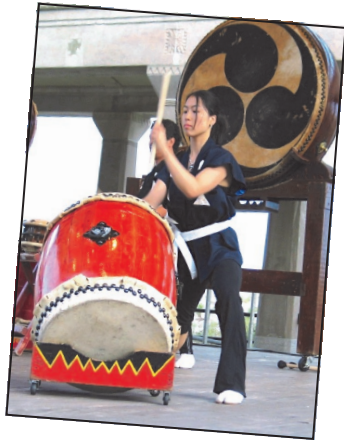
INTERNATIONAL NIGHTS Wednesdays in July, August at Kennedy Plaza