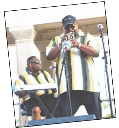
CHICKEN BONE BEACH JAZZ Thursdays in July/August at Kennedy Plaza

LOOK FOR SCHEDULES OF THESE EVENTS IN THE JULY/AUGUST EDITION OF DISCOVERY!