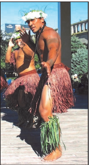
Hawaiian Luau Show, which will perform Sept. 5, is a local favorite with its Polynesian music and dance.

The Fifth annual Atlantic City Library International Night Series, co-sponsored by the City of Atlantic City and funded in part by the Casino Reinvestment Development Authority (CRDA), wraps up with a performance by Hawaiian Luau Show at 7 p.m. Sept. 5 at Kennedy Plaza.