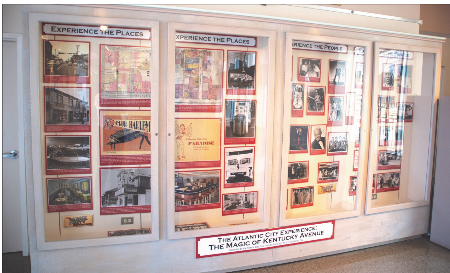
The Atlantic City Free Public Library officially assumed management of the Atlantic City Historical Museum on Aug. 22. The move will allow the library to showcase resources from its own Alfred M. Heston Collection — such as these historic Kentucky Avenue images (top) — at the Historical Museum, while continuing to exhibit Mr. Peanut (below) and other popular displays from the existing museum collection.