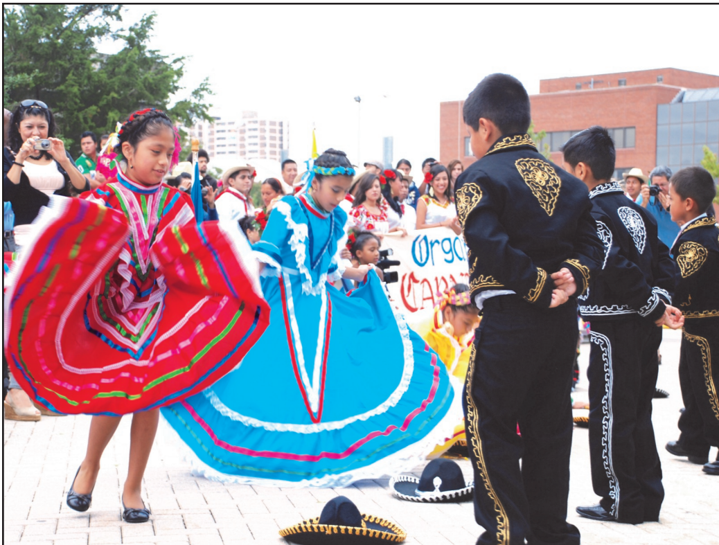
PHOTO: Local students performed a variety of dances at last year's Hispanic Heritage Month Celebration.

For more information, call (609) 334-5459.