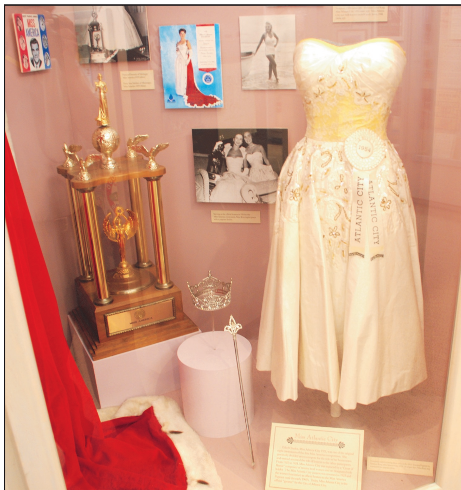
This Miss America display is another popular exhibit at the Atlantic City Historical Museum.

Atlantic City Library cardholders can access these resources 24 hours a day from any device with an Internet connection. Those who don't have an Atlantic City Library card can access them from a library computer.