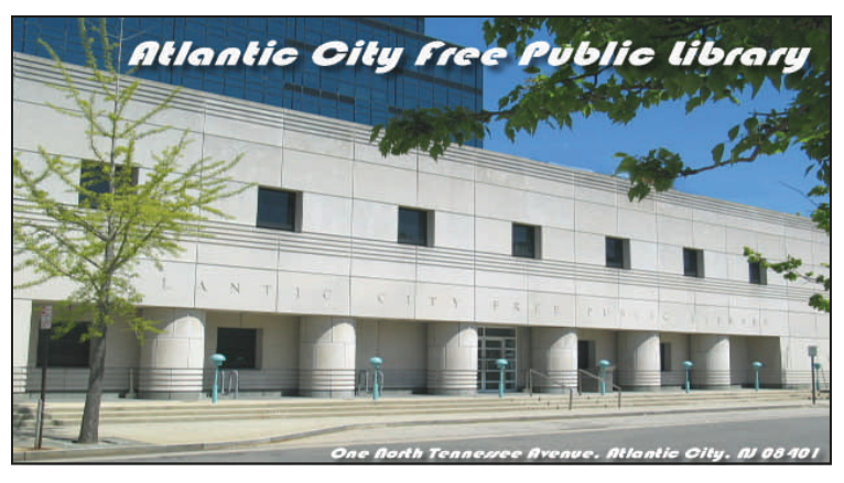
Now is the perfect time to sign up for and use your Atlantic City Free Public Library card.

Monday, April 13, at 10:30 a.m. — Therapeutic Reading: The OASIS (Older Adults Special Interest Series) group will take turns reading One Book New Jersey selection, Marley: A Dog Like No Other . The group will read to others at