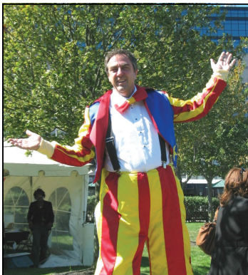
A stiltwalker who made balloon animals entertained children at the Atlantic City Arts, Books & Culture Festival.

Please visit www.atlanticcityfestival.org for festival updates throughout the year; or, call (609) 344-8338, ext. 246, or (609) 345-2269, ext. 3112.