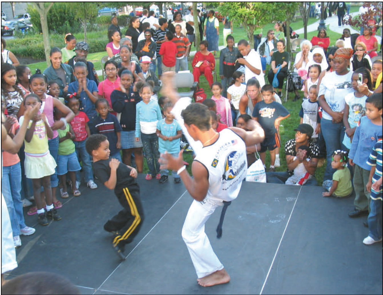
The crowd gathers to watch Atlantic City's Grupo Axe Capoeira Academy perform a Brazilian martial arts exhibition during the Second annual Atlantic City Arts, Books & Culture Festival, which was held Saturday, Sept. 29, in Center City Park.

The Atlantic City Free Public Library will be closed Tuesday, Nov. 6; Monday, Nov. 12; Thursday, Nov. 22; Monday, Dec. 24; Tuesday, Dec. 25