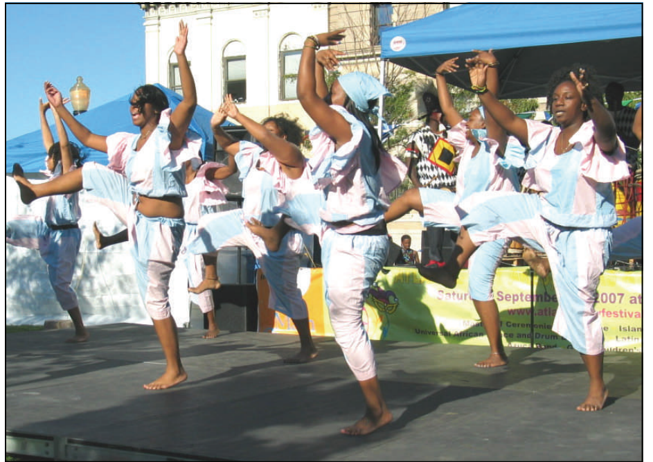
Universal African Dance and Drum Ensemble, shown here performing at the Second annual Atlantic City Arts, Books & Culture Festival on Saturday, Sept. 29, will bring its high-energy show to the Atlantic City Free Public Library for the library's 20th annual Kwanzaa celebration on Saturday, Dec. 15.

Universal has performed for leaders of countries, celebrities, politicians, religious, plus business and community leaders. Some of their performance locations have included: United Nations, Sony Blockbuster Entertainment Center, Tweeter Center in Camden, New Jersey State Aquarium, Kimmel Center, various Atlantic City casinos, Academy of Music, Interna-