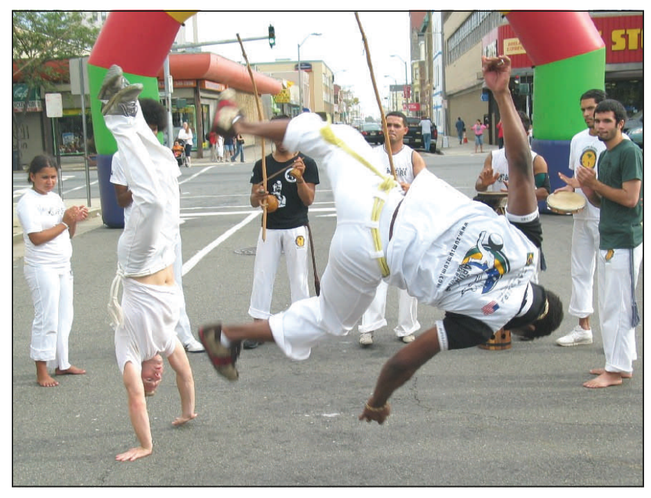
Atlantic City's Grupo Axe Capoeira Academy performed an acrobatic Brazilian martial arts demonstration on Tennessee Avenue, next to the Main Library. There were also moon bounces and games outside.