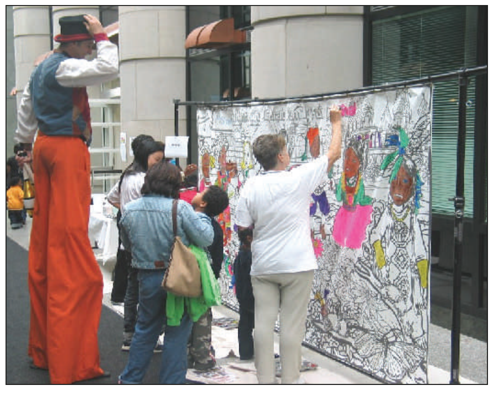
A stilt walker checks out a mural, sponsored by Main Street Atlantic City, that was completely painted by the end of the festival.