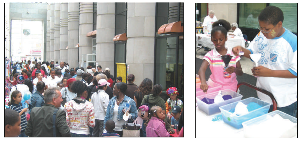
(Above) The atrium next to the library was packed as people checked out the variety of attractions and activities. (Top right) Attendees made free sand art.