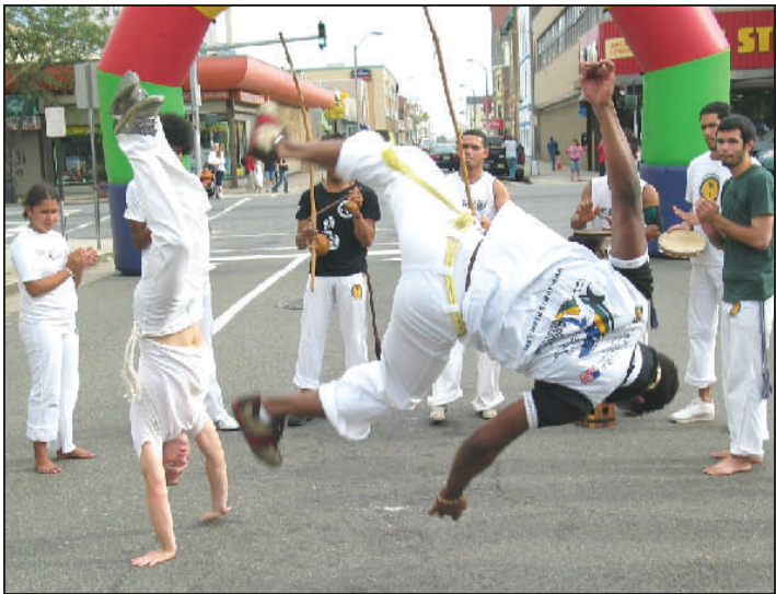
The acrobatic Grupo Axe Capoeira Brazilian martial arts group will be among the performers at the Atlantic City Library Family Fun Festival on Sept. 26.