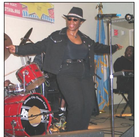
The festival will once again feature a variety of entertaining performers, including a stilt walker (left) and the Cason Express Band (above).